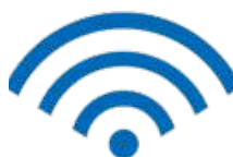
Fibre Optic Internet Connection