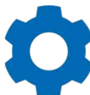
Customised Setup & Configuration