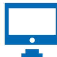
State Of The Art Equipment